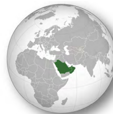
GCC Member States

This MoU allows for the organisation of a joint seminar between GCC, OTIF and CIT, by the end of 2014, in order to determine the areas of cooperation between these organisations.