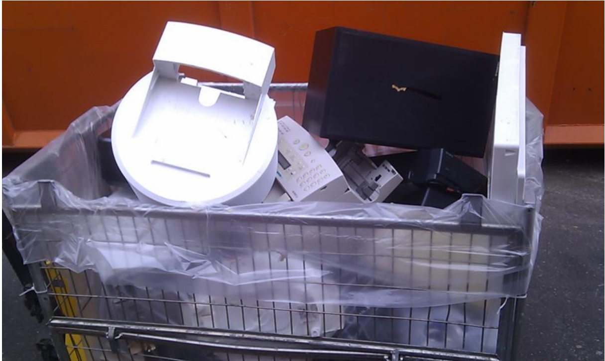
Foto 3: im Grosshandel verwendete faltbare Gitterboxen. Plastikfolien-Inliner werden nur z.T. verwendet