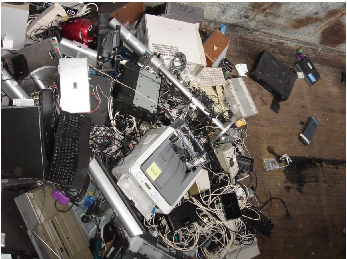
Foto 4: EAG die von grosser Höhe aus Sammelboxen in einen Transportcontainer umgeschüttet wurden. Es ist deutlich zu sehen, dass EAG aufplatzen und dabei können auch LIB herausgeschleudert und beschädigt werden