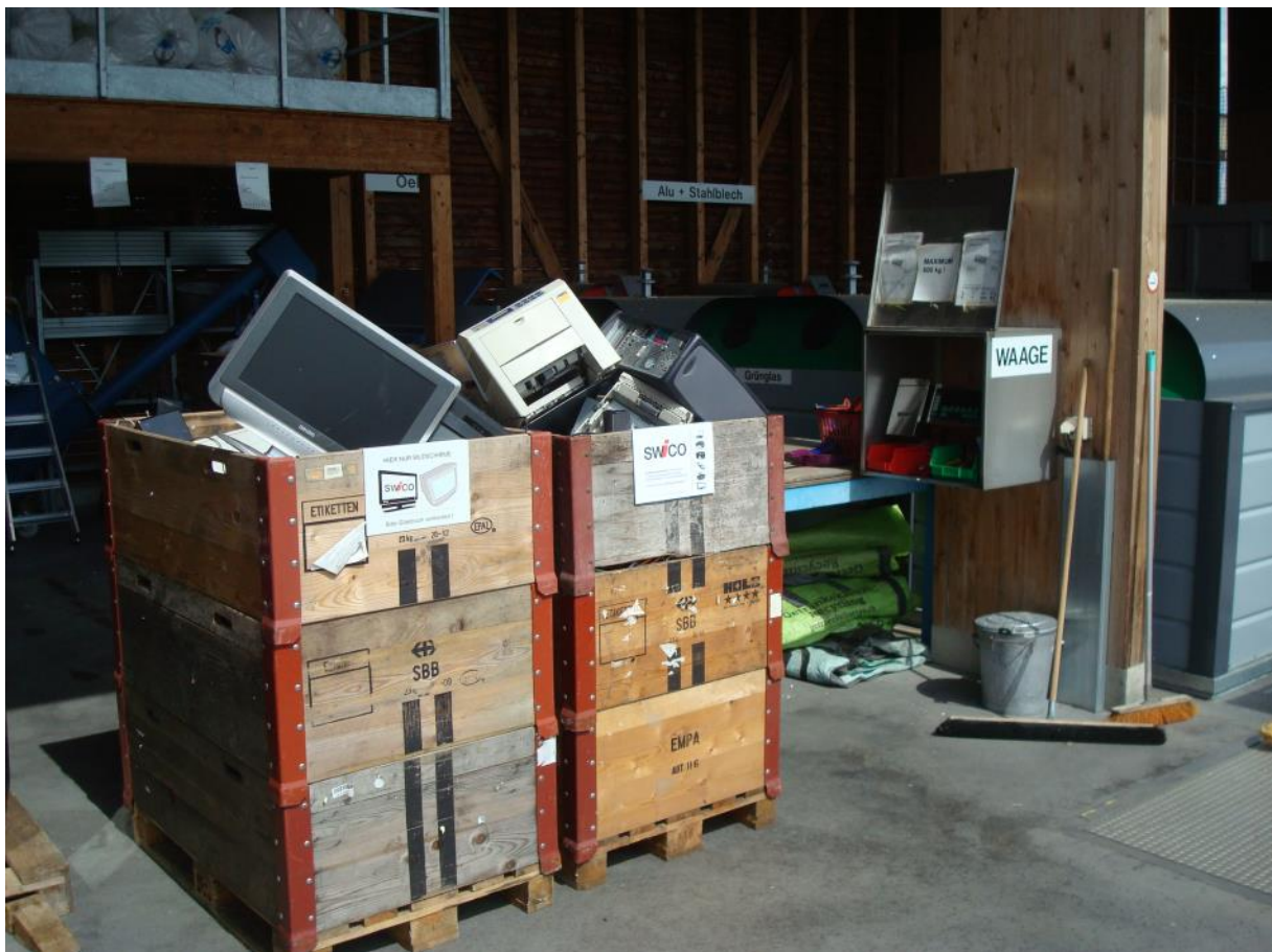
Foto 2: SBB Holz-Paletten mit -Rahmen an einer Swico Sammelstelle. Bildschirmgeräte werden bereits getrennt gesammelt (links), um Beschädigungen und mögliche Freisetzung von Quecksilber zu vermeiden.