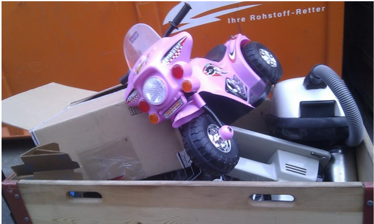
Foto 1: SBB Holz-Paletten mit -Rahmen, wie sie systemweit häufig verwendet werden, an einer Sens Sammelstelle.