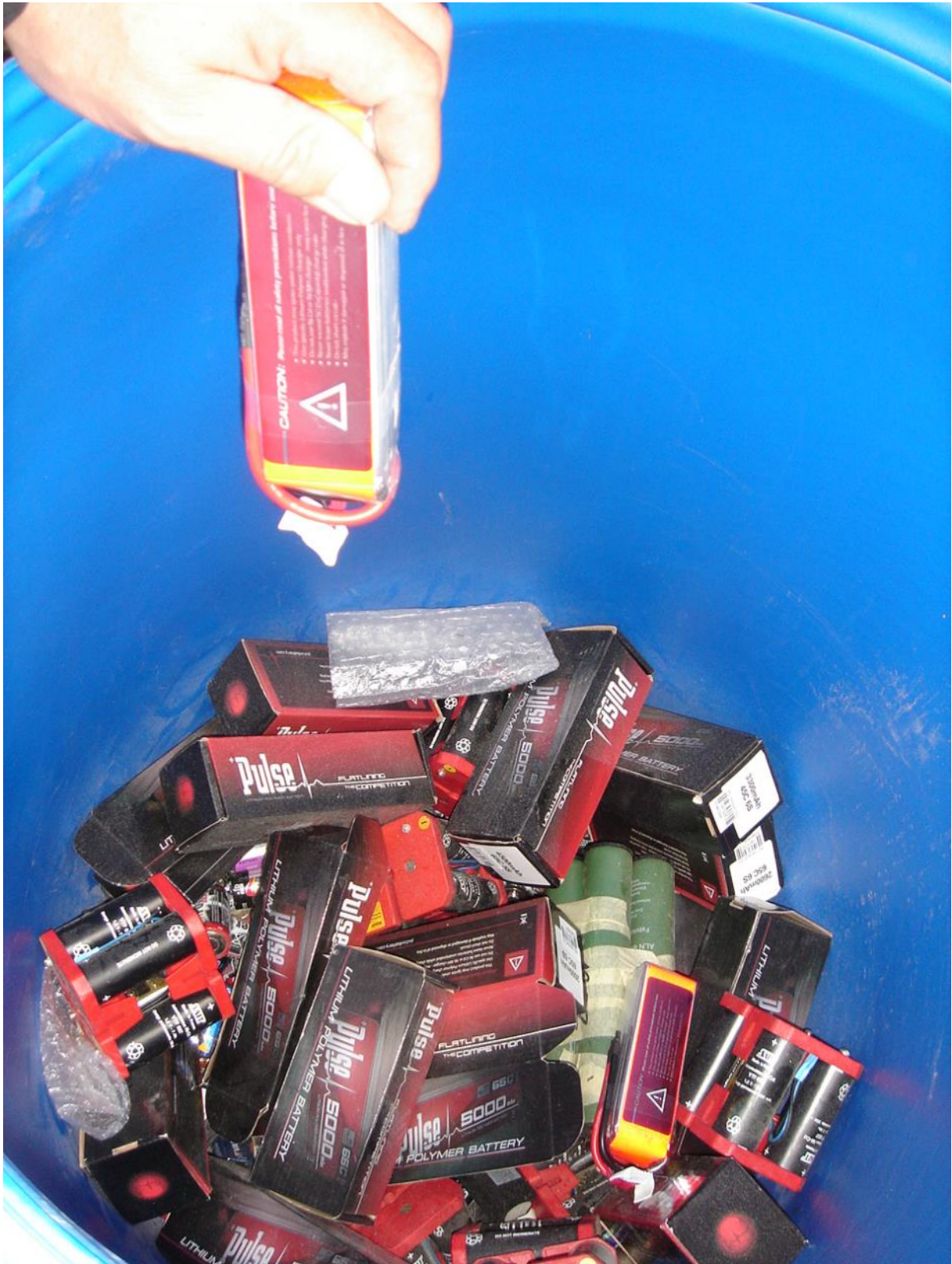
Foto 7: Immer häufiger finden sich Batteriepakete aus RC-Spielzeugen mit grossen Energiespeicherkapazitäten separiert in den Inobat Sammelfässern. Diese gelangen von Abgebern so zu den Sammelstellen oder werden in Zerlegebetrieben so entfrachtet und gesammelt.

Foto 6: Immer häufiger finden sich RC-Spielzeuge mit grossen Energiespeicherkapazitäten im Schüttgut. Interessanterweise scheinen diese Abgeber sensibilisiert zu sein, denn in den allermeisten Fällen sind die Batteriepakete bereits entfernt.