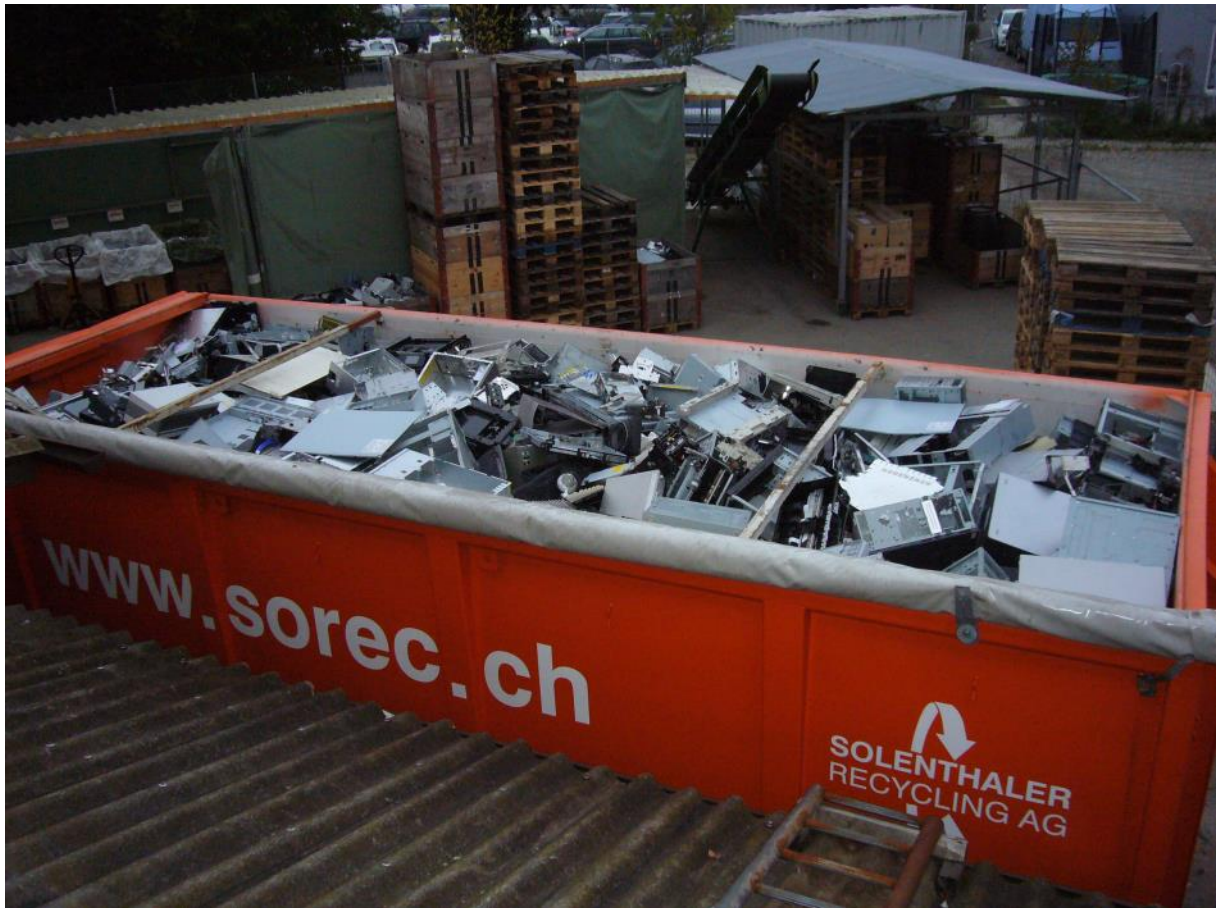
Foto 5: Schad- Stör- und Wertstoffentfrachtete EAG, die bei einem Zerlegebetrieb (Erstverarbeiter) für den Weitertransport an den Recycler in Container gesammelt werden. In diesem Fall sind Batterien als Gefahrstoffe bereits entnommen und die Sammlung / der Transport als Schüttgut anwendbar.