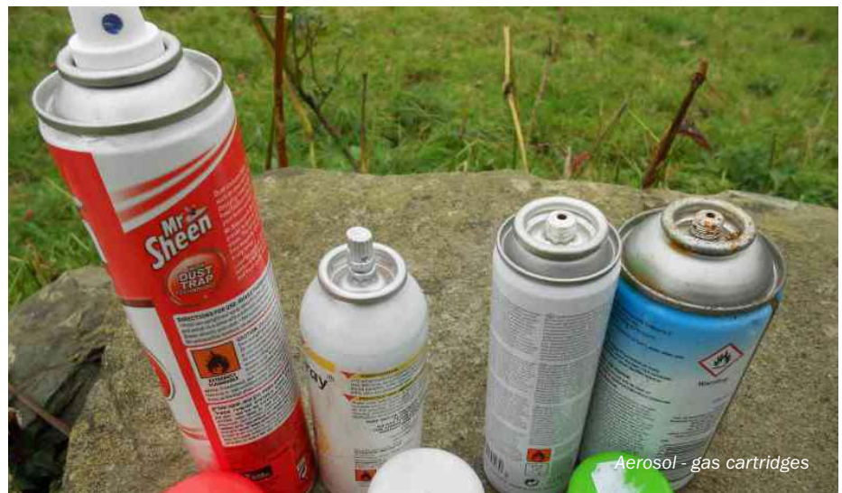
Aerosol - gas cartridges

The Stainless Steel Container Association was of the view that the provisions for the minimum wall thickness of metal IBCs constituted an obstacle to innovations that could lead to a reduction in the weight of the packaging. It should suffice that metal IBCs pass the required design type tests successfully. The Association substantiated this with tests carried out at the Rhineland Technical Inspection Agency in Halle on an IBC with a wall thickness of 0.97 mm (top), 0.98 mm (sides) and 1.42 mm (bottom), as opposed to the required 1.5 mm. This IBC passed all the design type tests