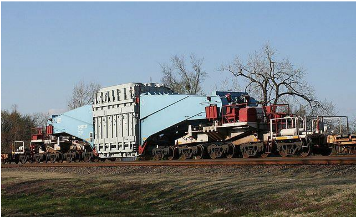
Figure 1: Example of a vehicle that increases its length in loaded configuration and its payload is part of the vehicle structure (in loaded configuration)

In case of OTMs in transport (running) configuration, if the applicant chooses to apply the TSI, he can apply either the WAG TSI or the LOC&PAS TSI for conformity assessment; a vehicle may be assessed under either of the TSIs depending on the characteristics and the intended use of the vehicle in question in comparison with the technical scope of the respective TSIs. In case the applicant chooses not to apply the TSIs, the applicant still needs to apply the procedure for authorisation set out in Regulation 2018/545.