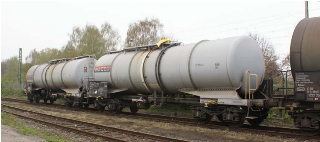
Both tank-wagons with spill bag emergency repair on top